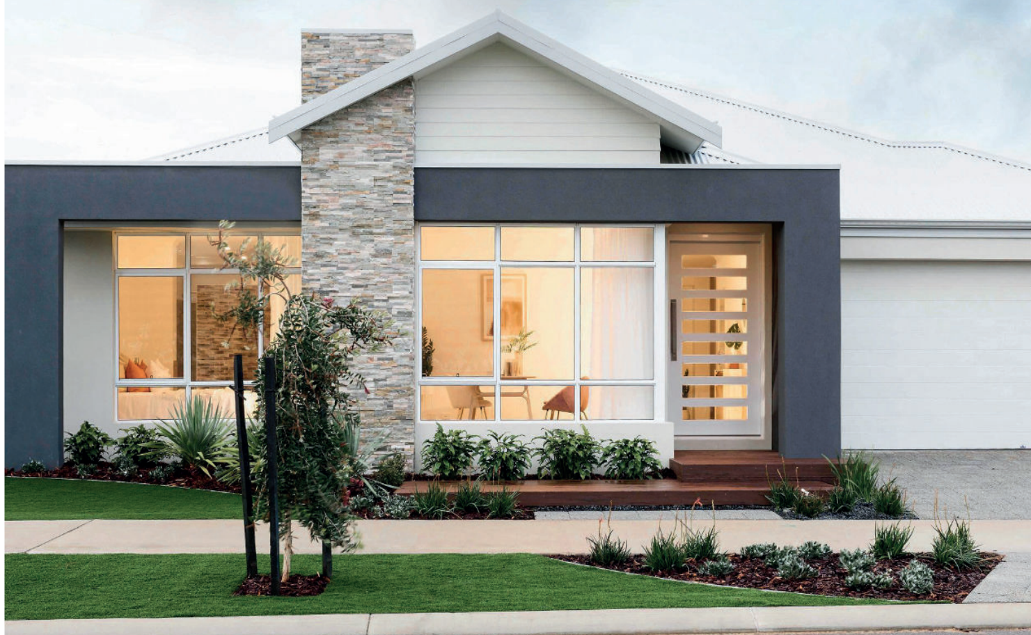
RAPALLO GROVE, MADORA BAY